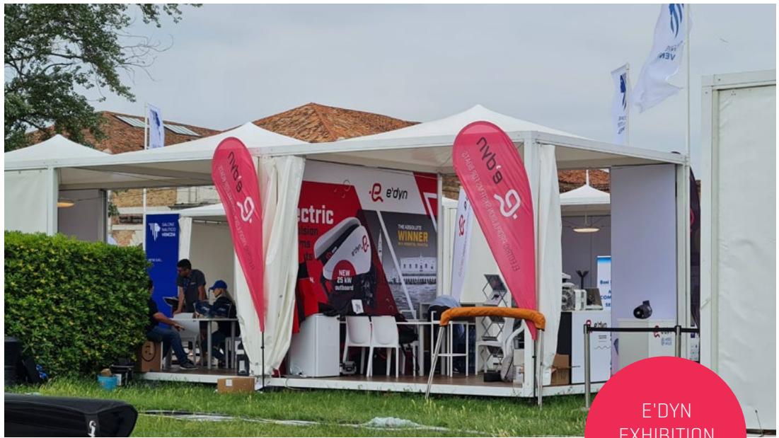
E'DYN EXHIBITION SPACE