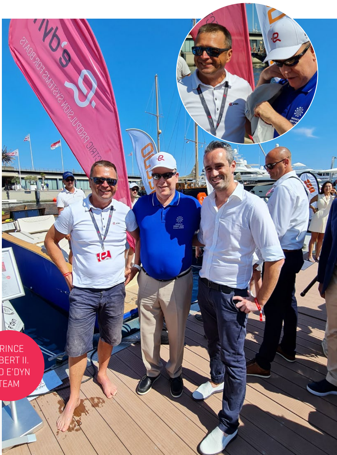
PRINCE ALBERT II. AND E'DYN TEAM

The Monaco Energy Boat Challenge is certainly a unique event for all nautical enthusiasts. The exhibition e'dyn also visited Prince Albert II himself, who looked closer to the electrical systems presented and had a chat with a nice e'dyn team. Apparently, the enthusiasm was mutual, because Prince Albert II was happy to wear e'dyn sports cap on his head and he even posed with e'dyn team. No doubt e'dyn can record this event as a great success in its own visibility. Congratulations to the team that with its positive approach and ingenuity realised the best possible product placement .